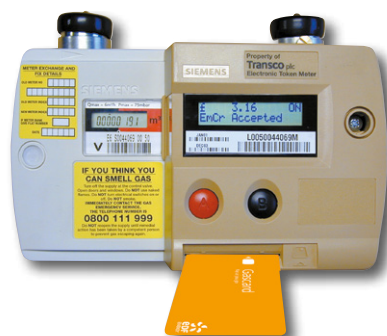
An example of a gas meter

To move through the screens, keep pressing the red button. You might need to insert your gas card to access more detailed information.