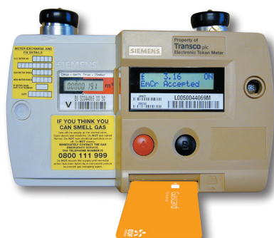
An example of a gas meter

To move through the screens, keep pressing the red button. You might need to insert your gas card to access more detailed information.