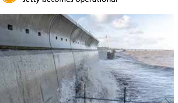
November 2019 Sea wall completed