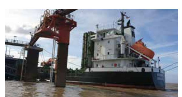
August 2019 Jetty becomes operational